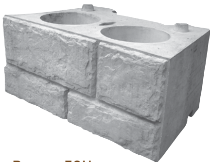
Bronco 30H 67.5" x 30" x 45" 4,600 lbs.