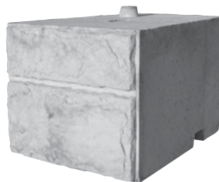
Half Unit 2,700 lbs.