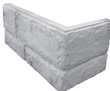
Corner Cap Unit 3,450 lbs.