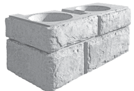
Universal Corner Unit 4,050 lbs.