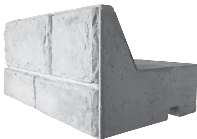
Cap Unit 3,300 lbs.