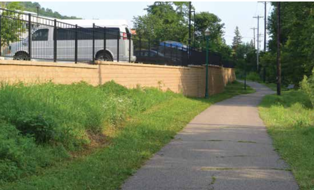
Left For the 500-foot-long wall, Landscape Reflections Inc. of Oakdale, Minn., installed 3,800 square feet of VERSA-LOK Standard units and 2,200 square yards of the manufacturer's geogrid soil reinforcement product.

Right Each side of the renovated building includes terraced retaining walls for plantings to transition from the street to the parking lot. A series of five rain gardens and an infiltration pond were also installed to prevent nearly all runoff from the site from entering the city's storm drain system.